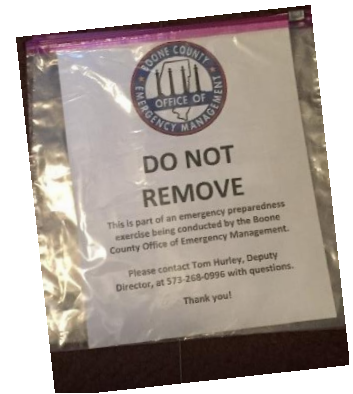
Figure 1 Information Packets

At 9:00 AM, Saturday November 9, 2019, BCARES deployed 19 amateur radio operators in pursuit of the Information Packets that had been created and distributed to 29 Red Cross designated shelters throughout the county by the Boone County Office of Emergency Management (OEM) on the day before. The Information Packets contained instructions and data for the creation of an ICS213 message to be sent from each of these shelters to the ECC. These shelters are located in the communities of Hartsburg, Ashland, Hallsville, Centralia, Sturgeon, Columbia, and the Red Cross office in Jefferson City. See Map. The SET concluded at 12:00 PM with all stations being cleared off net by 12:15 PM. The SET was designed to strain the capabilities of BCARES to pass ICS213s from all ends of the county back to the ECC.