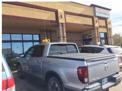
Figure 2 BCARES Trackers for APRS

Two operators were dispatched to the Emergency Communications Center (ECC) to operate Net control and collect incoming ICS213s utilizing the amateur radio station (WX0BC) located inside the county 911-Dispatch Center. Sixteen operators (including one pair) were assigned to two shelters each to cover the 30 sites in the test. One operator was operating RELAY in the adjacent county (Callaway) from the Callaway Public Health Department amateur radio station to aid in communications from the southern end of Boone County. A portable UHF repeater was deployed to assess the effectiveness of its portability and area of coverage. Winlink email was the preferred mode of passing the ICS213 traffic to the ECC. This would have relieved operators at ECC from the burden of copying traffic in real time which compromised other functions. Eight operators were equipped for Winlink mobile operations. The Amateur Radio facility at the ECC provided VHF Packet and HF-ARDOP Winlink nodes (K0SI-10). Five operators provided APRS capabilities in their vehicles and five BCARES stand-alone Trackers were deployed on other vehicles. These were displayed on the APRS map at the ECC.