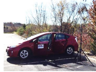
Figure 5 Deployed Portable UHF repeater

relayed from the Callaway RELAY, and the rest were received by voice directly at the ECC. The portable UHF repeater was contacted by five operators over a 7-mile radius at each of its two deployed locations.