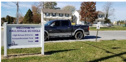
Figure 4 Mobile deployed to Shelter

(146.610, 146.76, 147.315, 444.175, 444.425-DMR) and two VHF Simplex frequencies. Twenty-six ICS213s were created and passed. Ten of these were directly passed using Winlink to the ECC inbox. Eight were