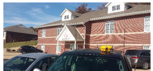
Figure 3 Mobile deployed to Red Cross - JC.